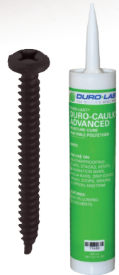
Duro-Last Approved Fastener and Caulk

The KnuckleHead System is engineered to safely support pipes, heavy equipment, duct work, solar panels and other rooftop accessories. KnuckleHeads are rated to hold up to 600 lbs. each or 16 psi distributed across the base (38.5 in 2 area). Insulation in a roof system is subject to compressive loads. Type II Class 2 Iso-Broad is widely used, having a compressive strength of 20 psi ( TABLE 1 ). Compressive loading of 600 lbs. will not damage Iso Board or other recovery board underlayment. TABLE 3 provides the suggested maximum allowable support load when installing KnuckleHeads.