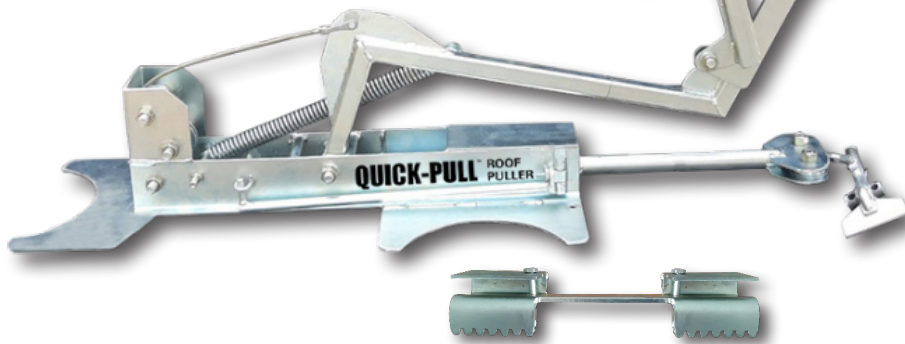
Removeable contact foot with grip teeth.

The Quick-Pull® Roof Puller is designed to align Duro-Last® membranes on the rooftop and assist in pulling deck sheets taut, providing a smooth finished installation. This updated tool utilizes a cable and pulley system and features an adjustable lever as well as a slip resistant contact plate on the bottom, allowing for use directly over an installed membrane when necessary. Also new on the Quick-Pull model is an optional contact foot with teeth, which can be attached when more grip is needed.